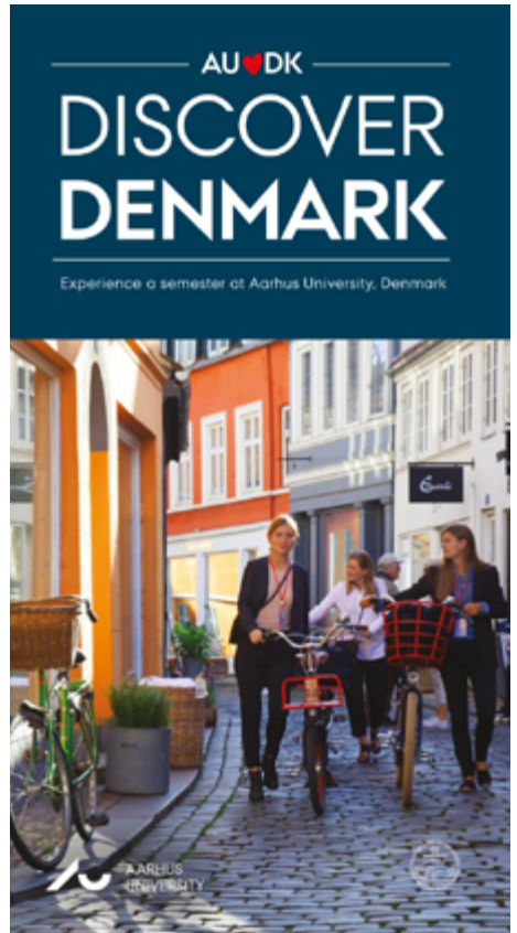
Cover page for a couple of our brochures